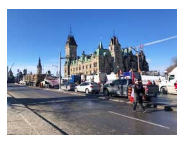
Unifor is urging all federal parties to condemn the 'Freedom Convoy' actions that have denied workers access to their jobs and continue to threaten the economic security of thousands. Read Unifor's statement here: