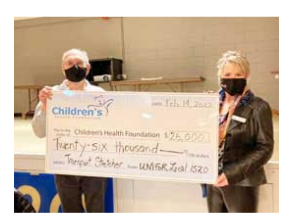
Retirees from the former Ford plant in St. Thomas donate $46,000 to help sick children in Southwestern Ontario and their families.