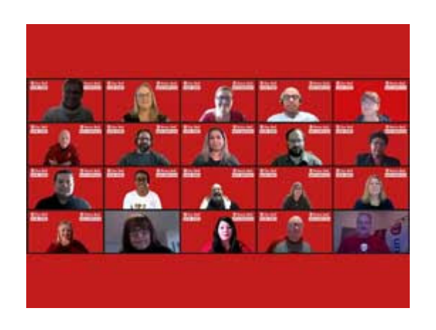
Contract negotiations begin for 4,200 Bell clerical workers in Ontario, Quebec.