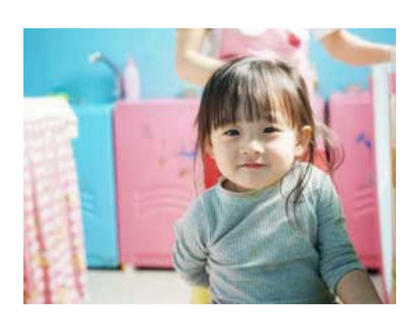
Ontario is still the last jurisdiction in Canada without a child care deal. Get ready for a Family Day action on Monday, Feb. 21 to tell Premier Ford to sign the federal child care plan.