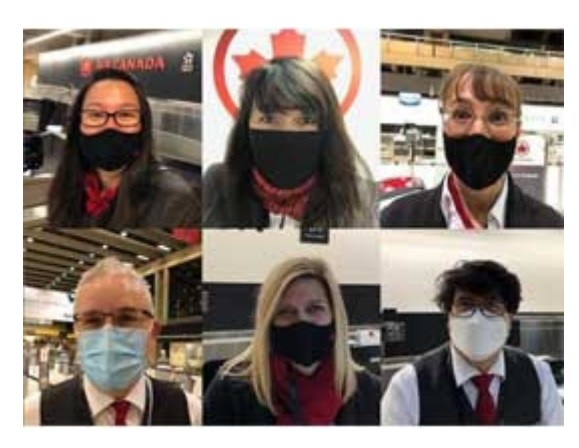
Unifor welcomes the federal government's announcement to lift several air travel restrictions to encourage more people to travel without extra barriers.