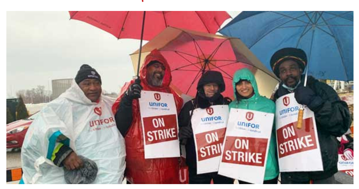
Picket lines went up at 5 a.m. Thursday as Oakville Transit refused to table an acceptable offer to improve working conditions and wages for members of Unifor Local 1256 since receiving a 72-hour strike notice on February 14, 2022.