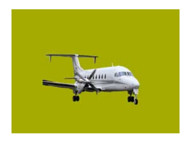
Unifor files appeal to defend pilots against EVAS Air stripping their seniority and recall rights following pandemic layoff.